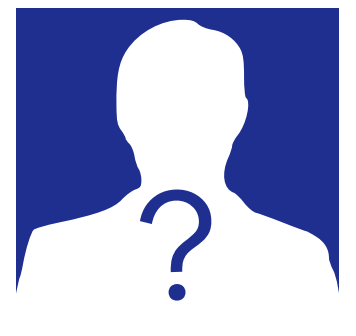
Could this be you?