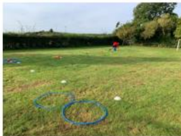
Outdoor Adventurous Activities

In Tag Rugby the children have developed: